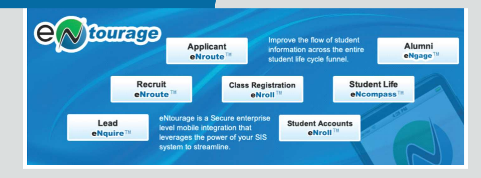
Prospect -> Recruit -> Applicant -> Student -> Alumni

A Suite of Enterprise Mobile Applications that Span John's Entire Student Life Cycle